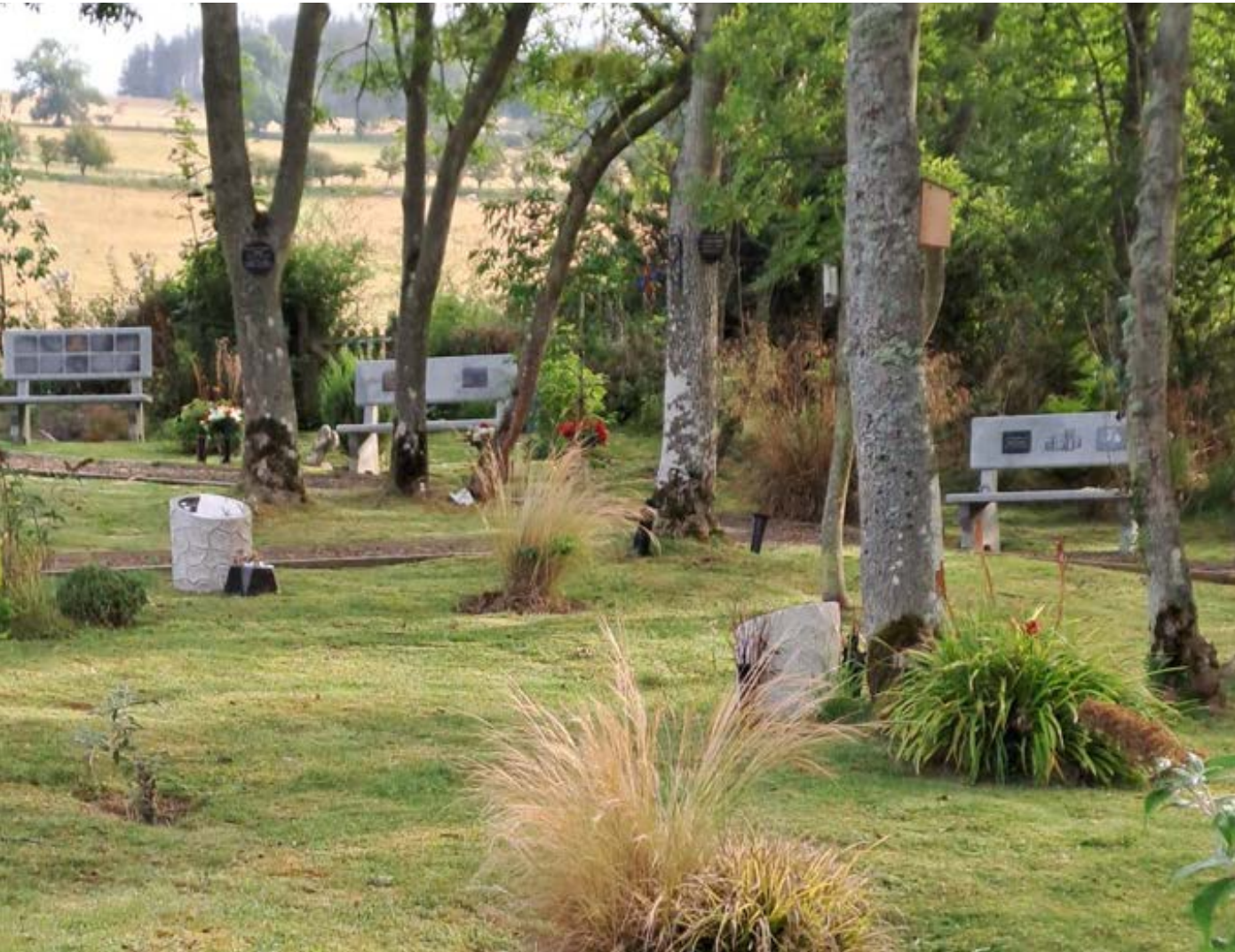
Memorials Memories that last a lifetime

Call us: 01361 850313 Email us: houndwood.crematorium@thecmg.co.uk