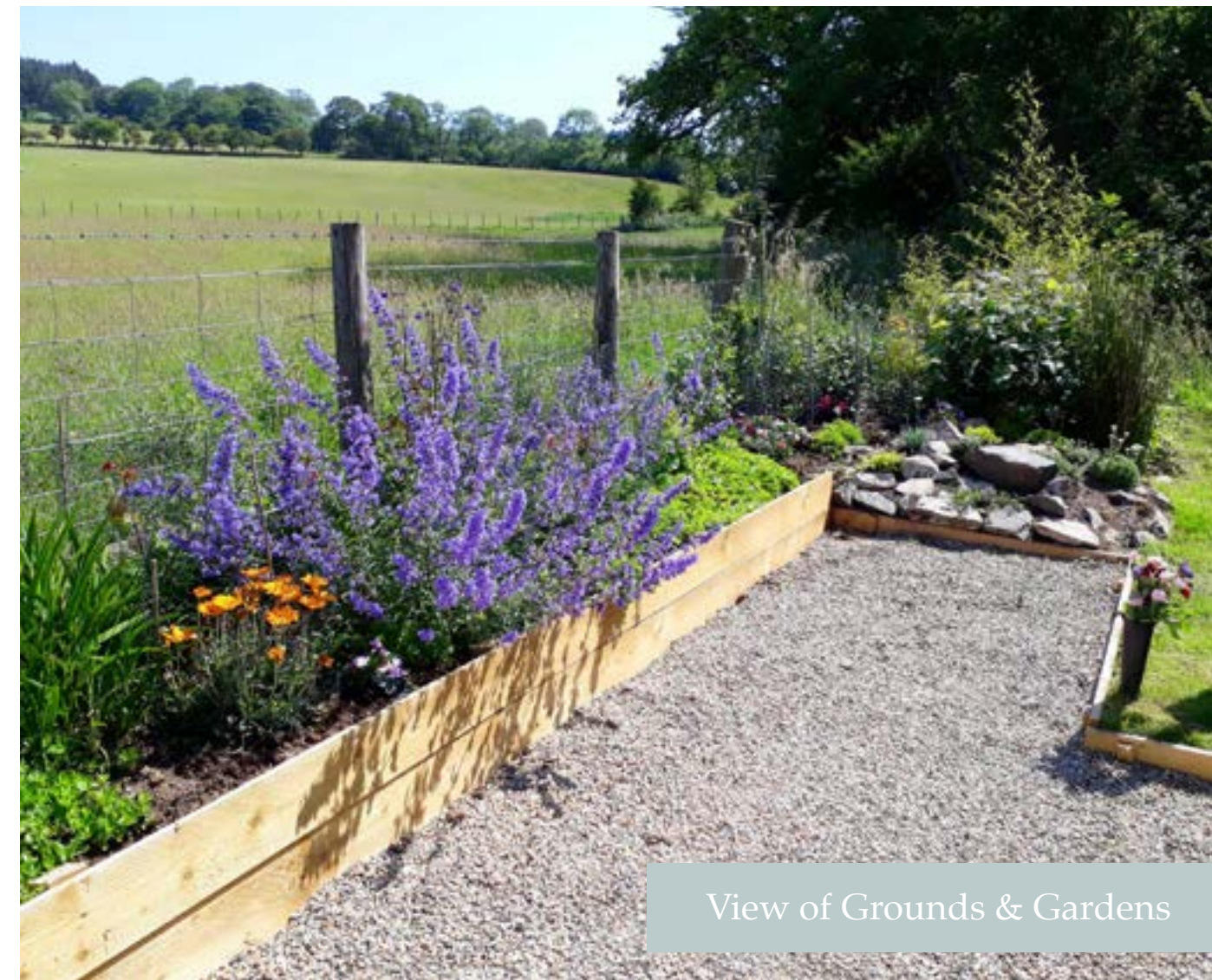
View of Grounds & Gardens

For a communal yet personal touch, we offer plaques on our granite benches overlooking our serene woodland grounds - perfect for quiet reflection. Plaques offer a unique and personal way to highlight the memory of your loved one, including their name, a heartfelt message, or other details of your choice, and can be placed in various locations across our grounds.