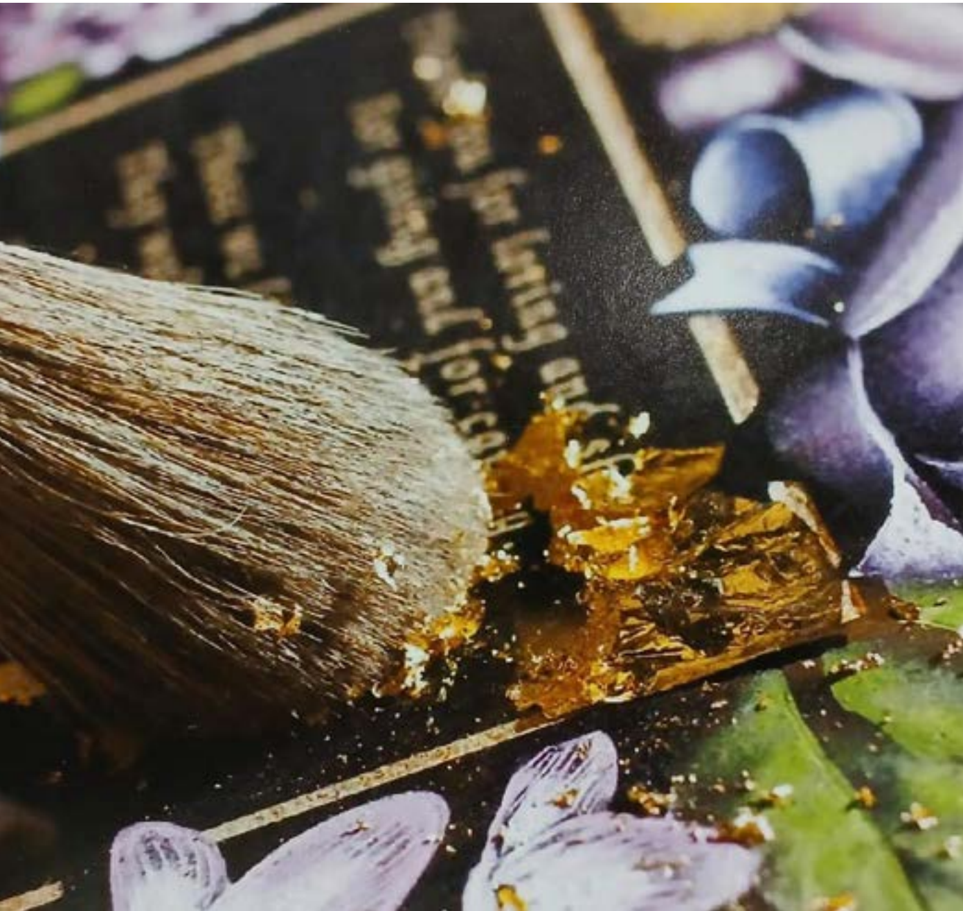
We're here to support you and provide guidance every step of the way.

Together, we can help you create a lasting Memorial that honours their unique spirit and celebrates their life.