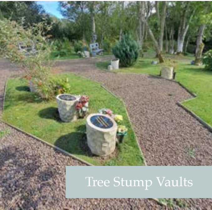
Tree Stump Vaults

We offer a variety of on-site Memorial options, ensuring that every family can find a fitting tribute for their loved one. From traditional plaques to unique, tree stump vaults, our Memorial Garden offers an intimate space for your loved ones to be remembered.