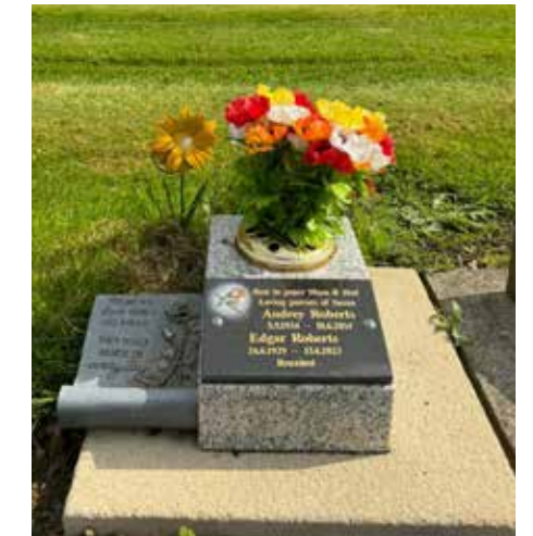
Black Granite Book