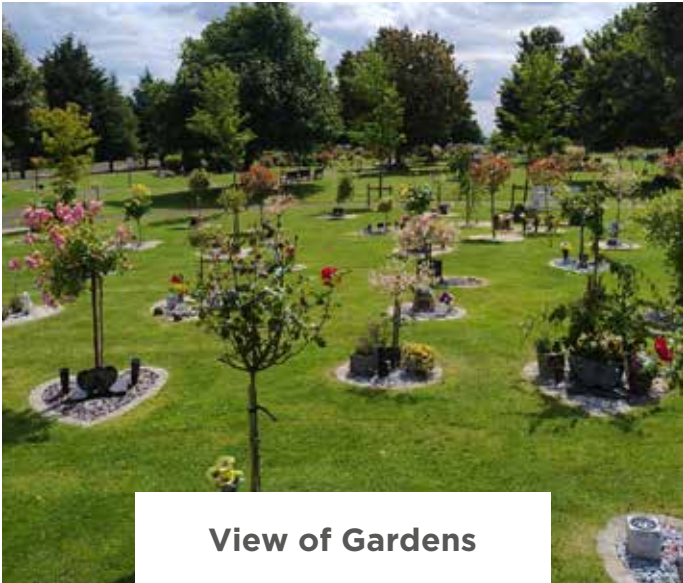
View of Gardens

At Grenoside Crematorium, our Memorial Gardens are more than just a place of rest — they are a sanctuary where families can celebrate and honour the lives of their loved ones in a meaningful and personal way.